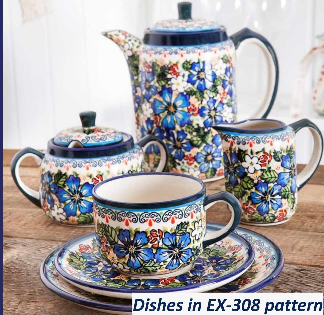
Dishes in EX-308 pattern