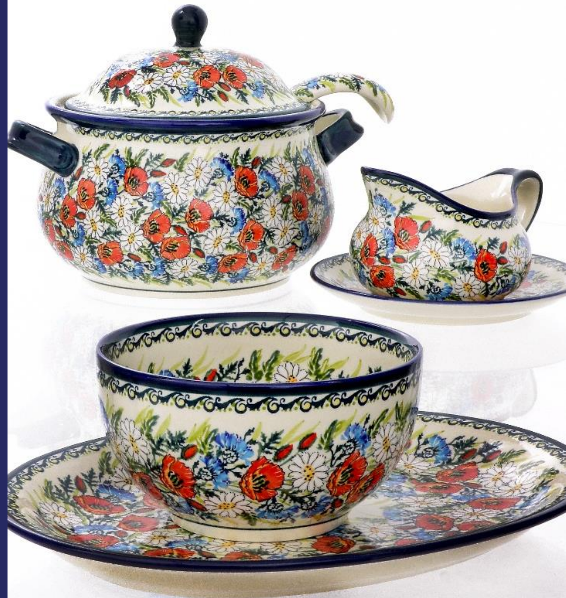
Dishes in EX-341 patterns