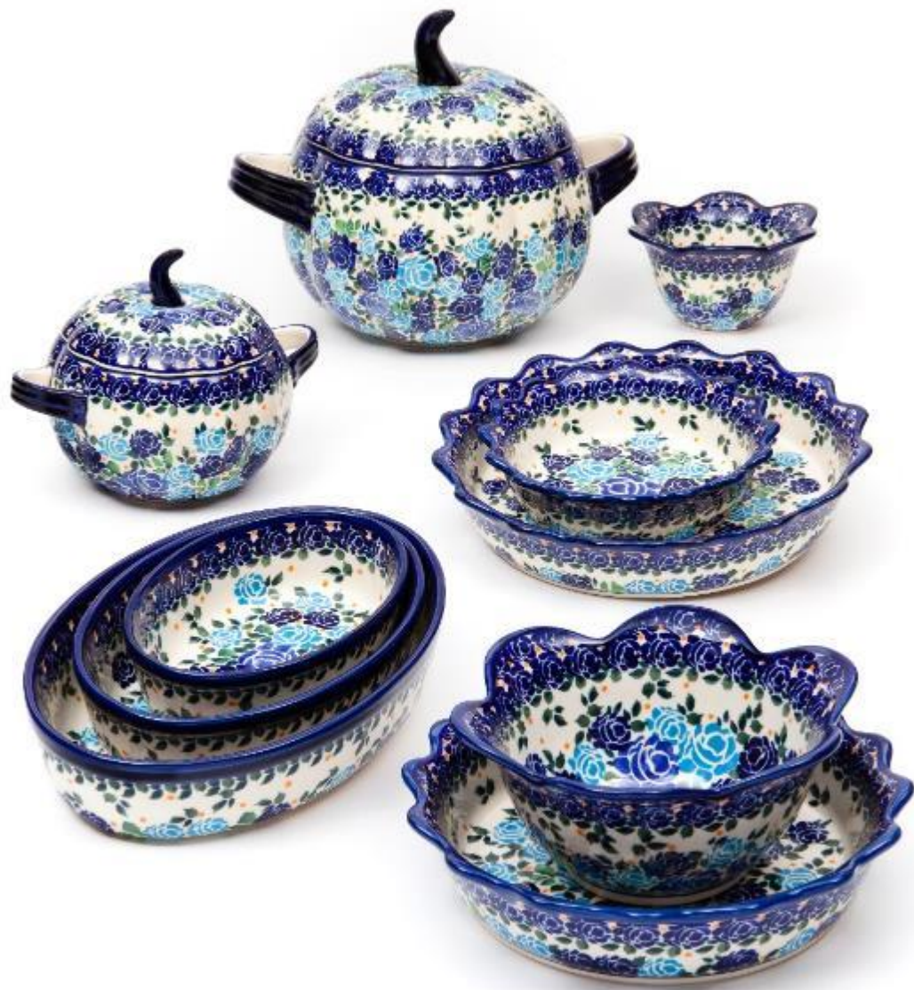
Dishes in pattern DU-177