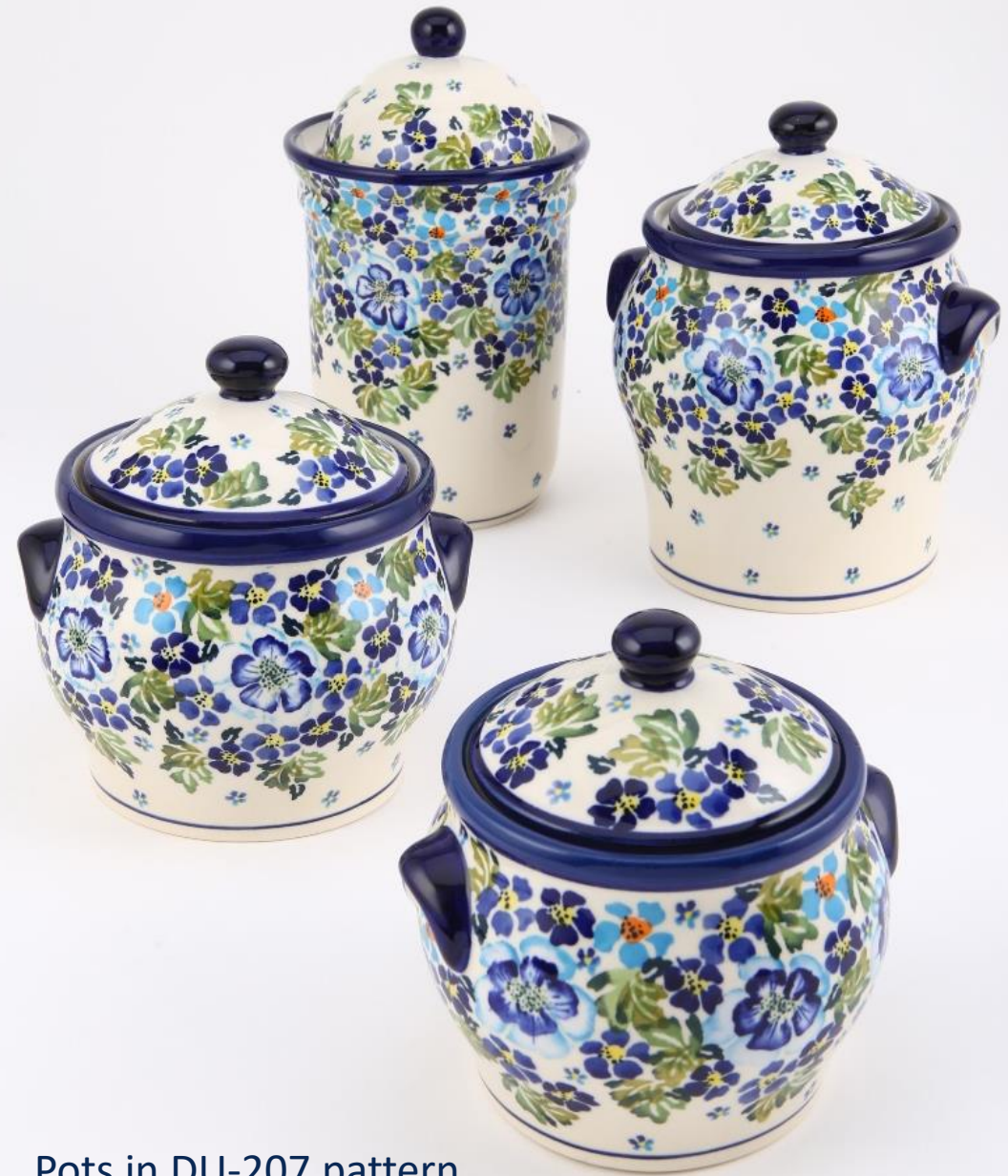
Pots in DU-207 pattern