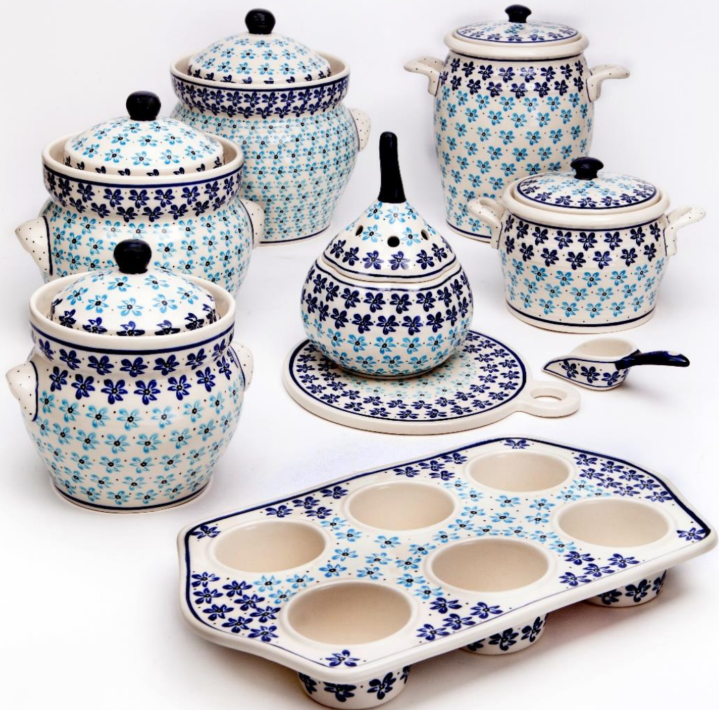
Pots and muffin pan in D-1111 pattern