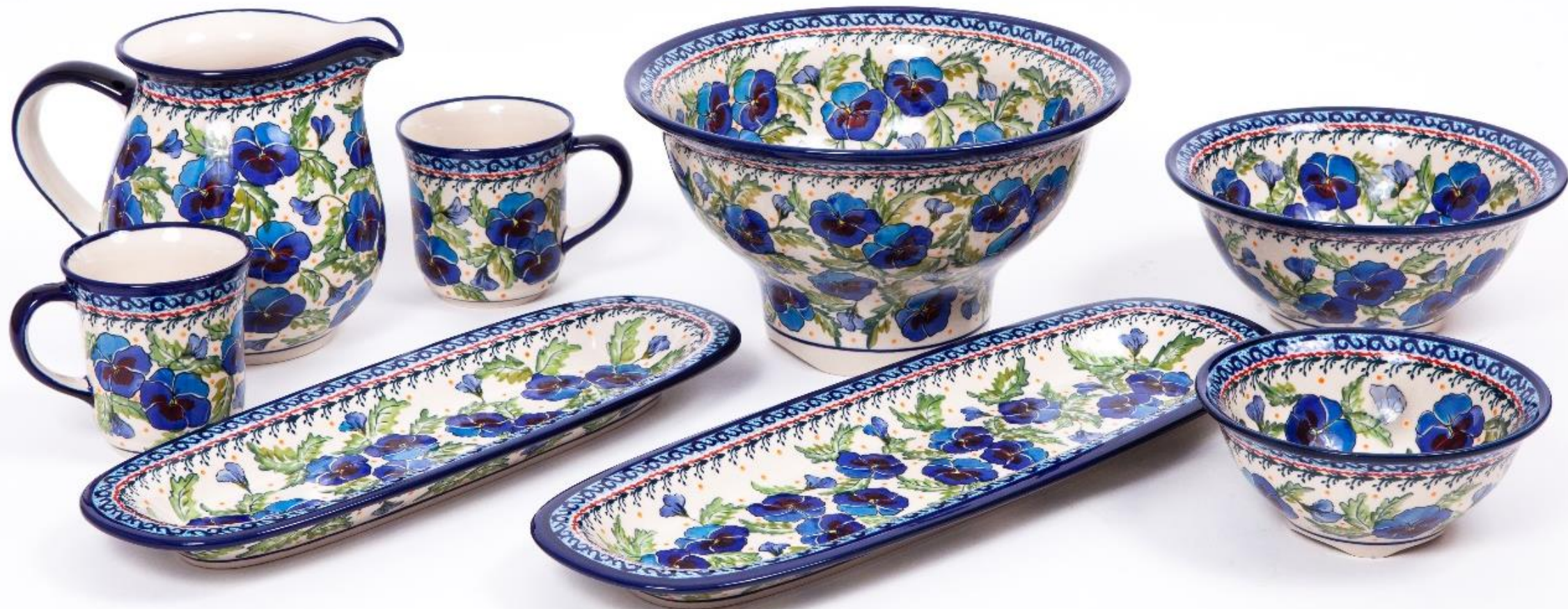
Dishes in pattern ART-277