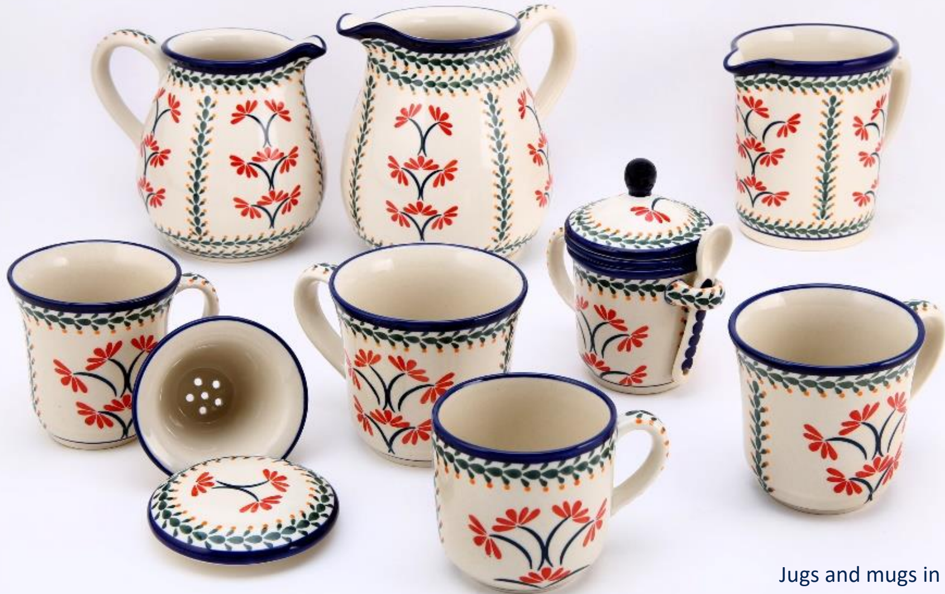
Jugs and mugs in A-1158A patterns