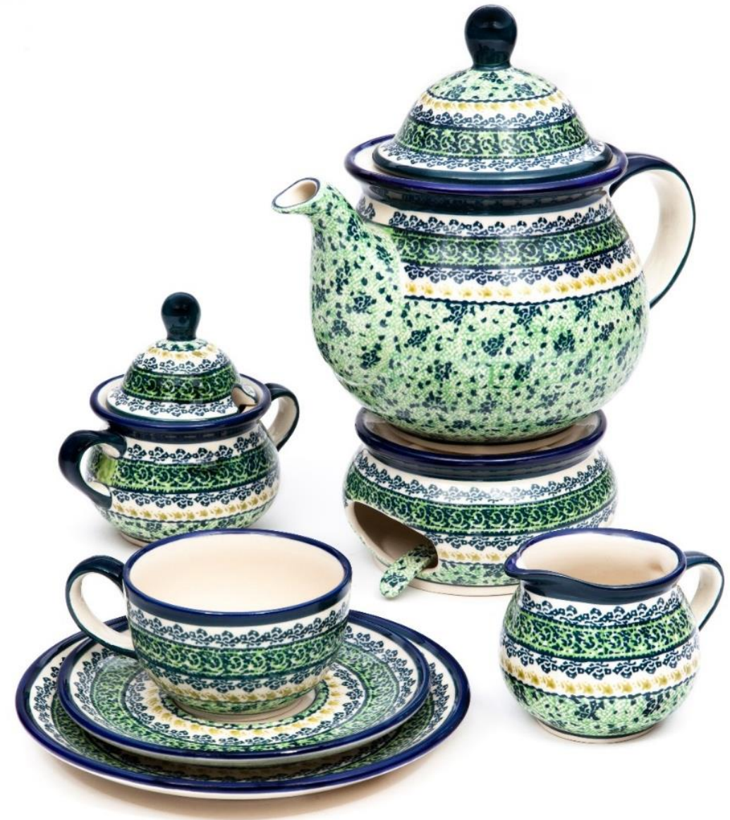
Coffee and tea set ALICJA in A-1097A pattern