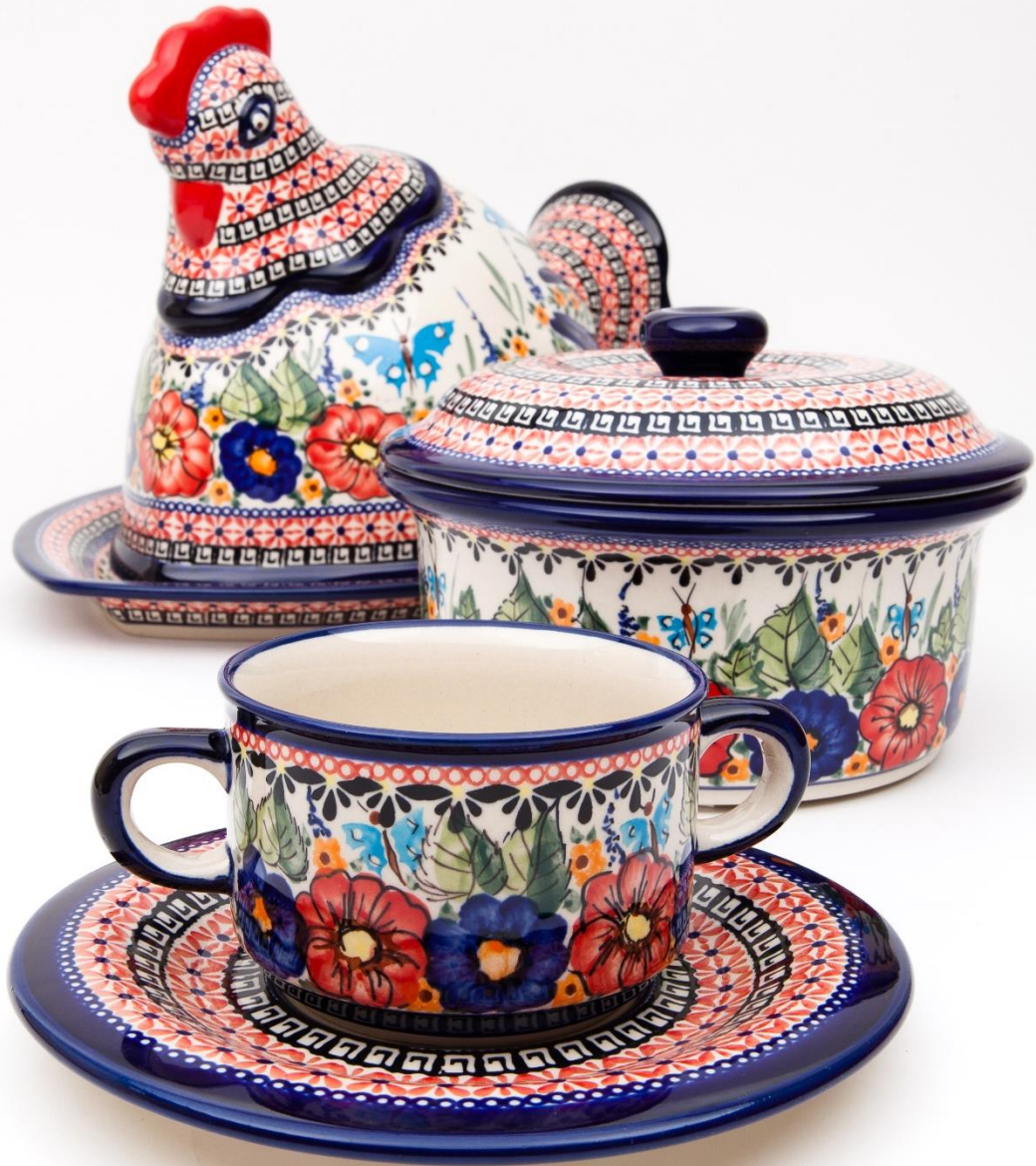
Dishes in ART-149 pattern