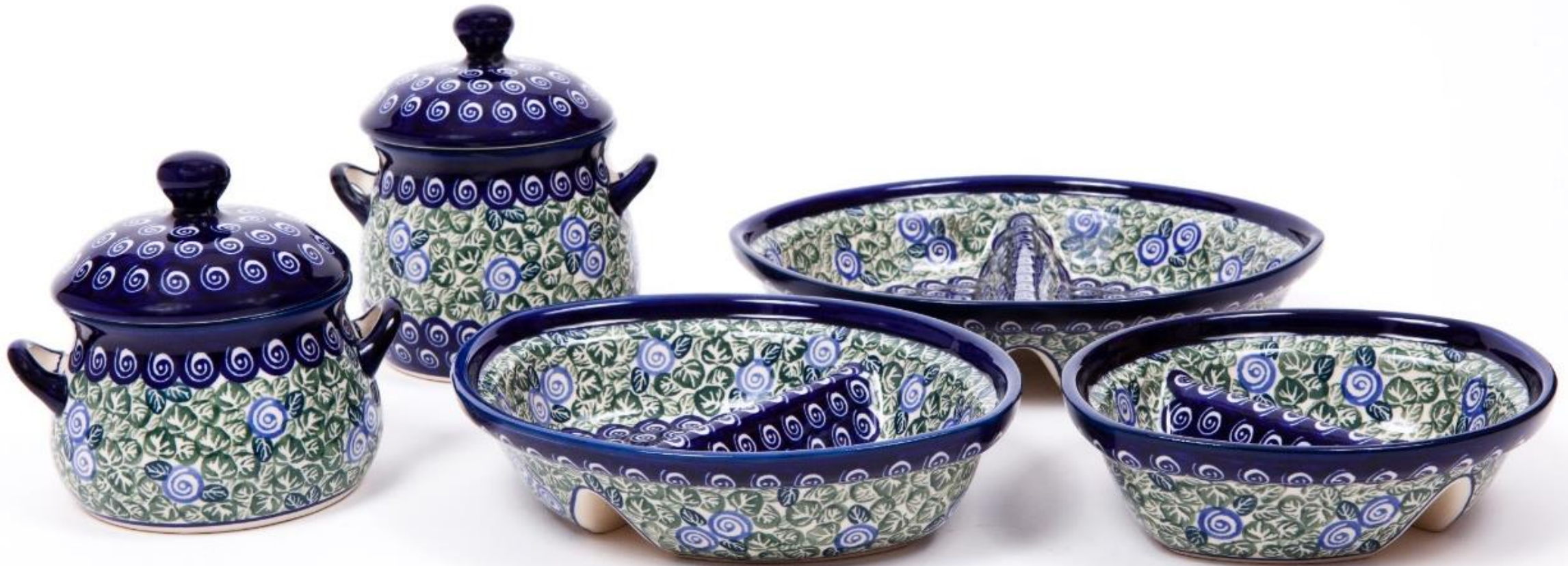
Dishes in A-1073A pattern