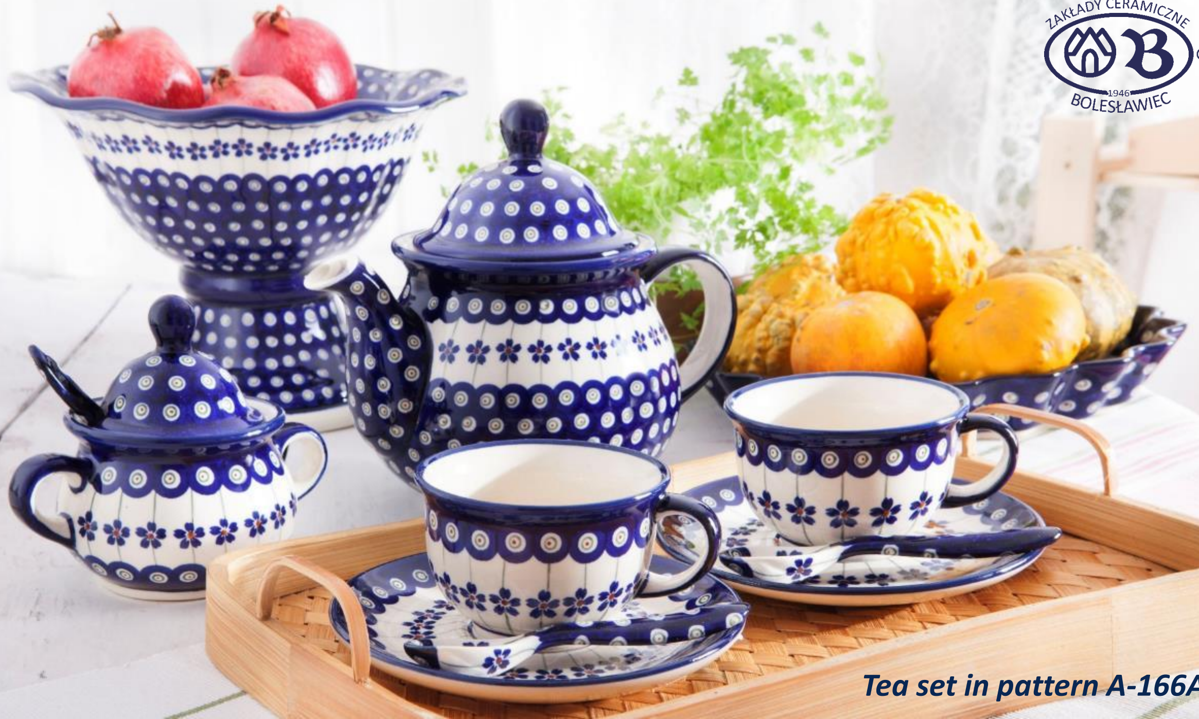
Tea set in pattern A-166A