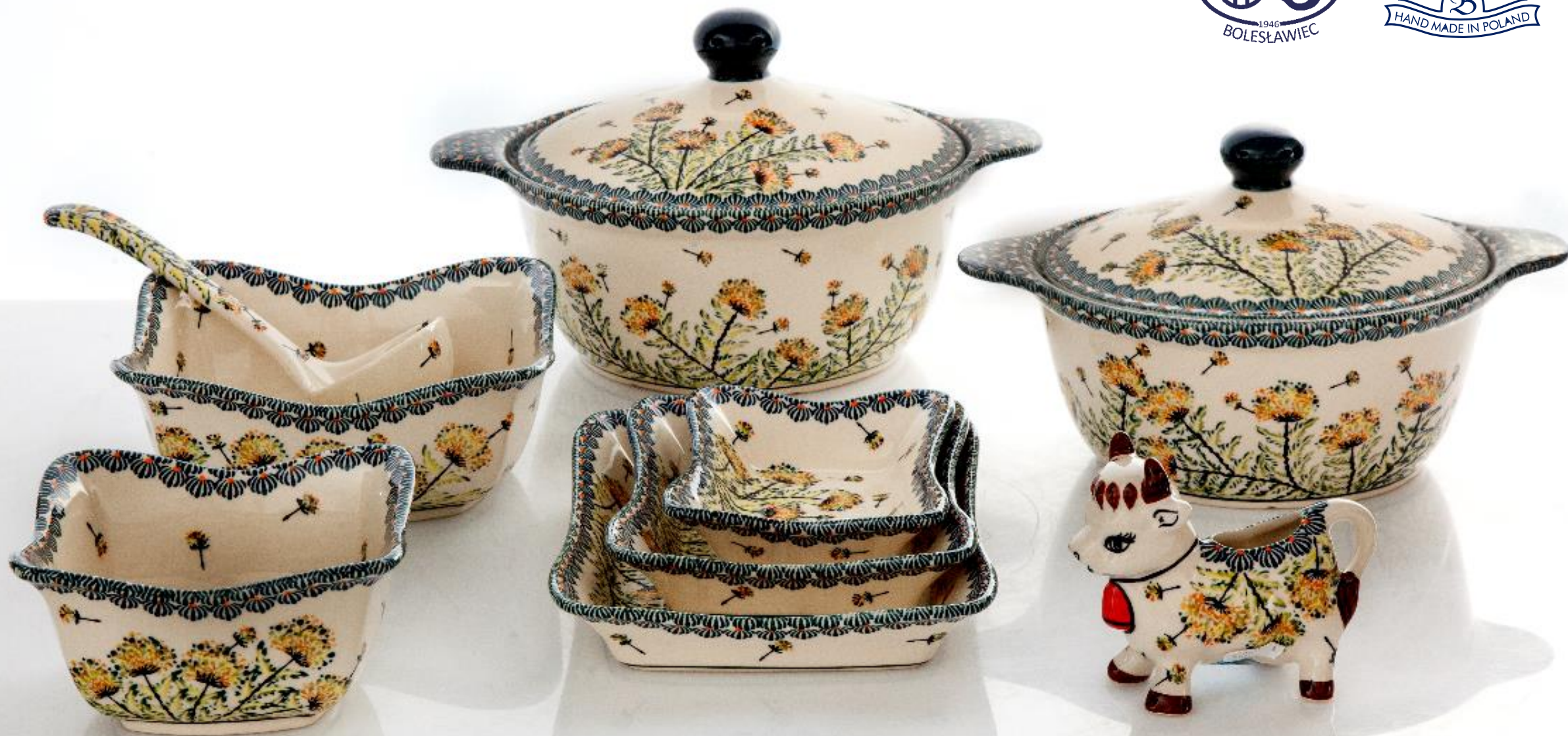
Pots, bowls and dishes in DU-201 pattern