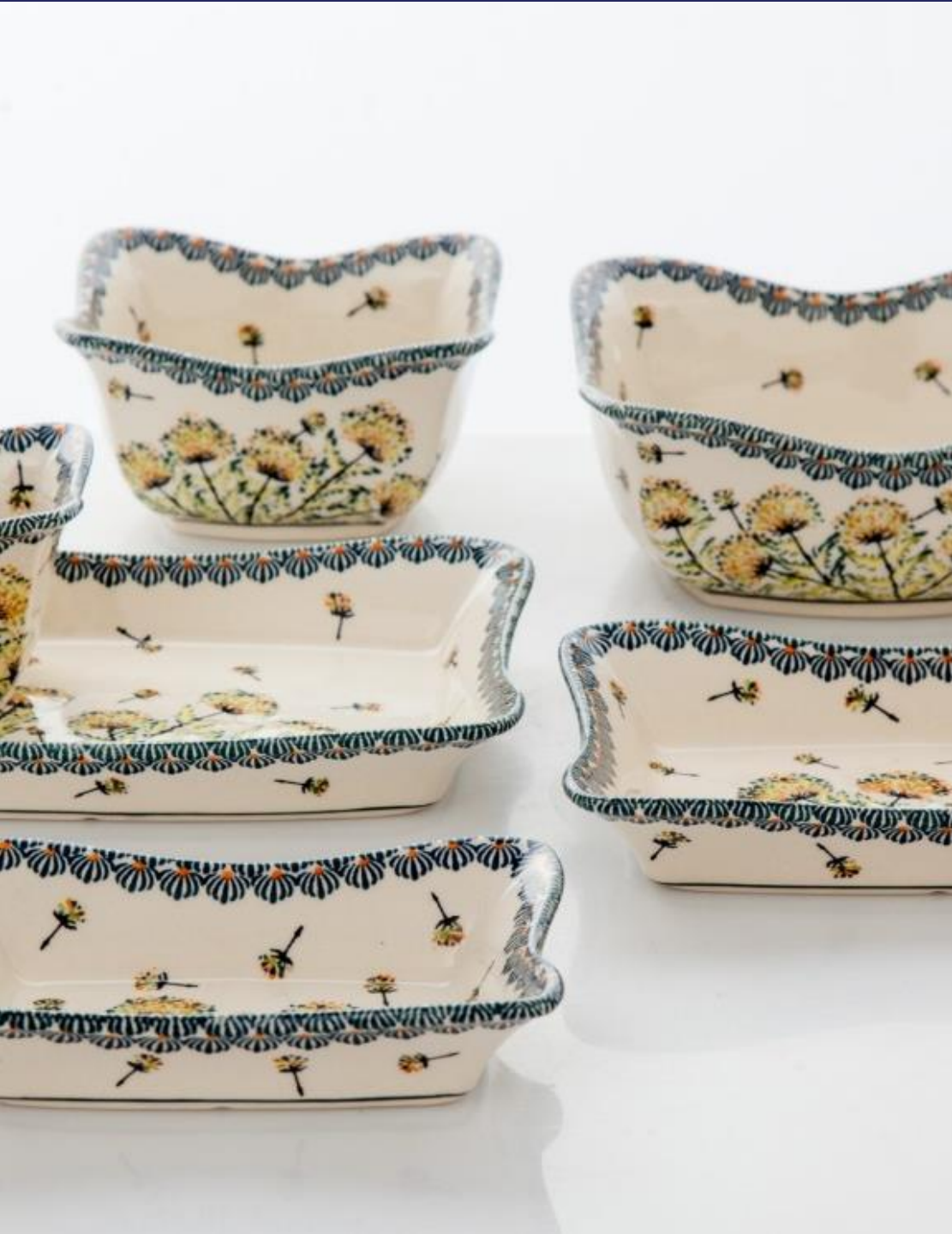
Collection of bowls and dishes in DU-201 pattern. Shapes by Janina Bany-Kozłowska, 2015 Pattern by Danuta Amborska, 2015