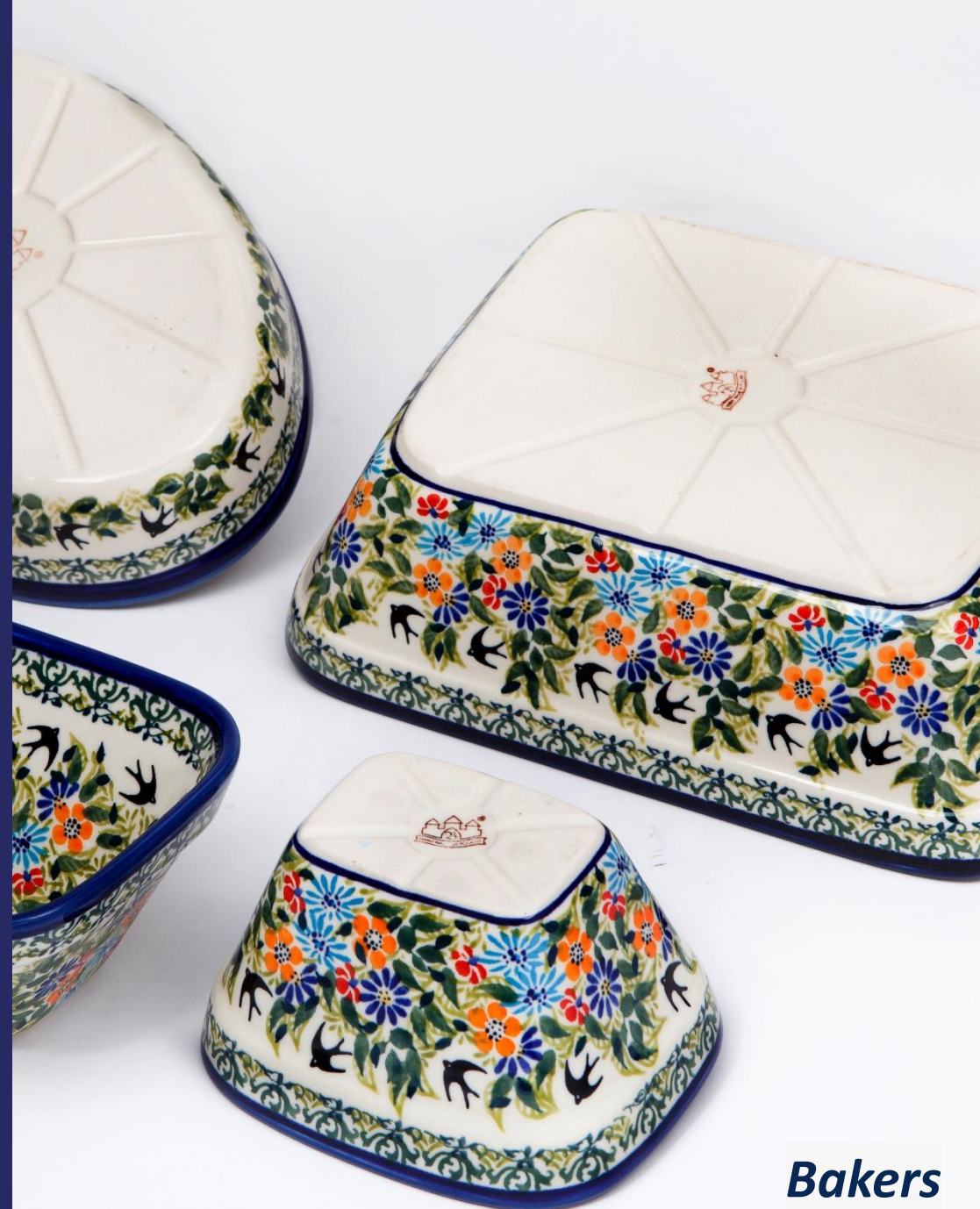
Bakers in DU-185 pattern

Our dishes with so-called grooved bottom are intended to roast/bake in conventional gas or electric ovens, on glass and ceramic plates and on fixed electric plates.