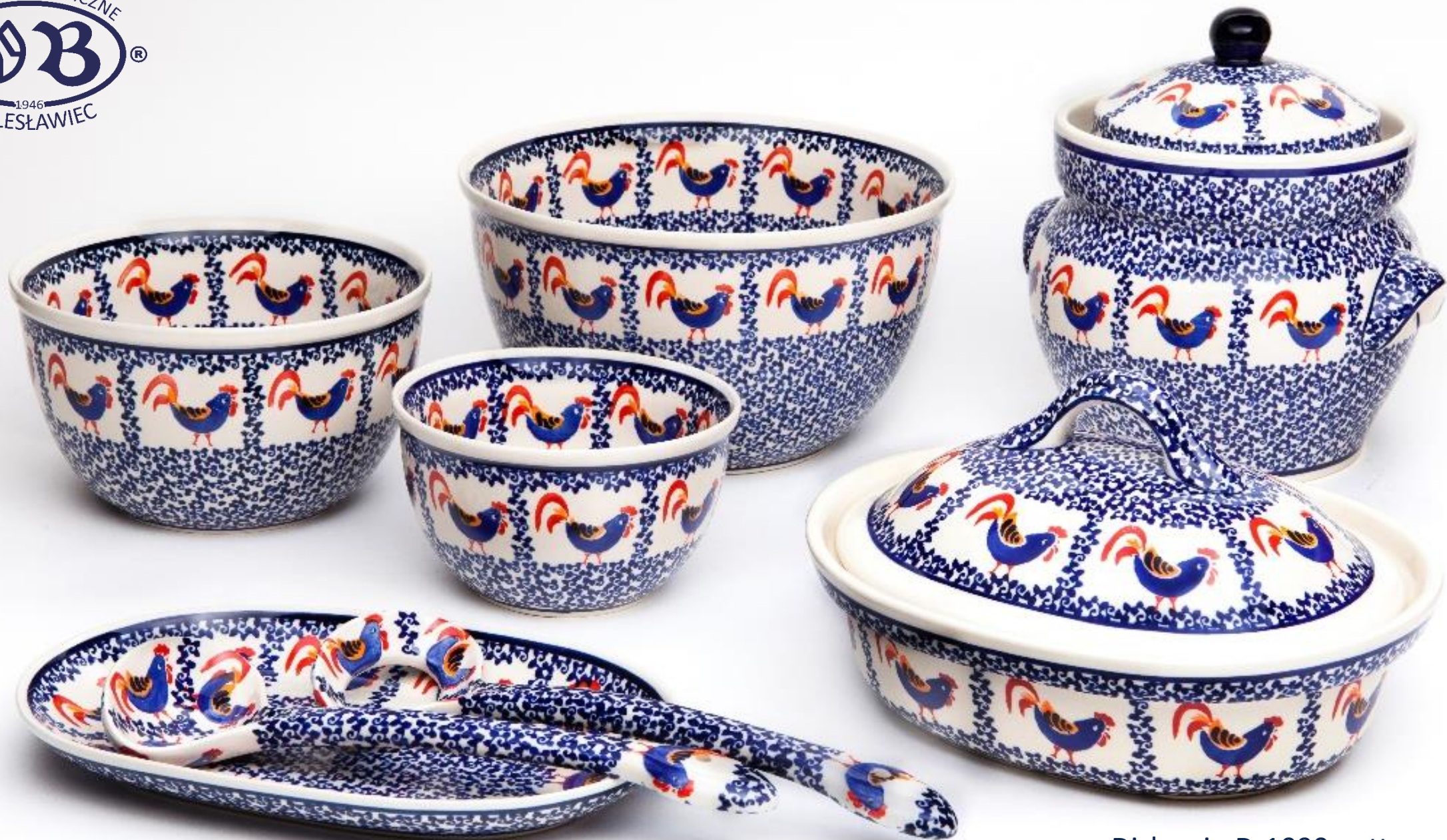
Dishes in D-1090 patterns