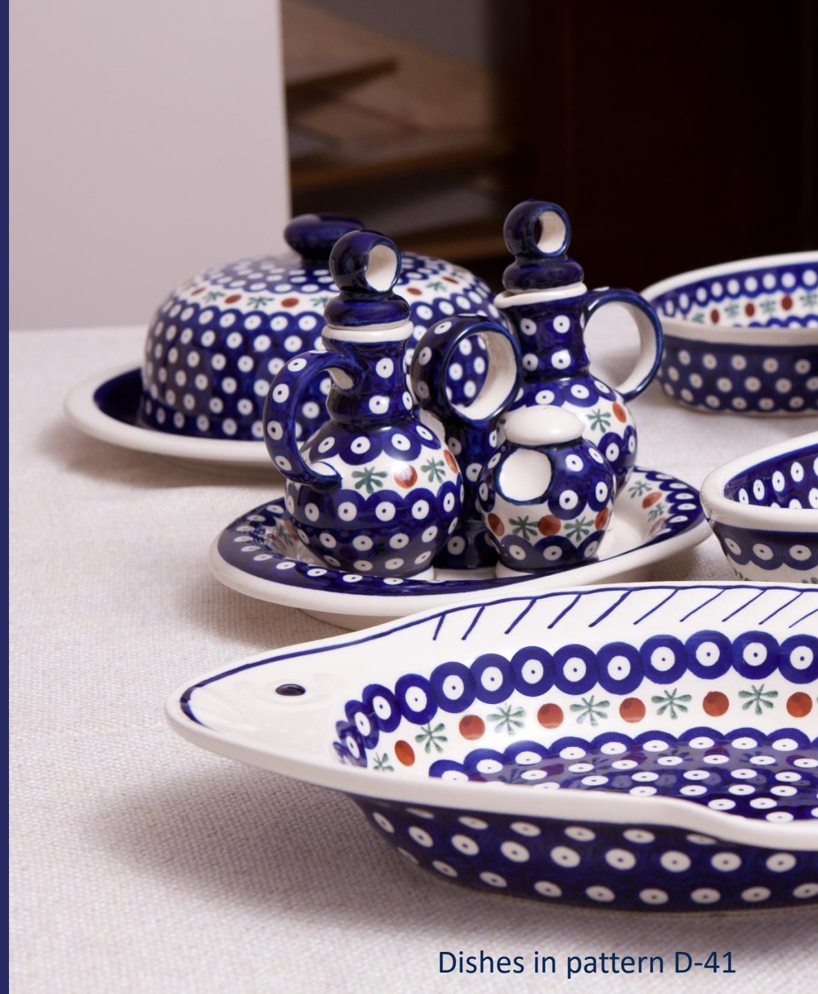
Dishes in pattern D-41