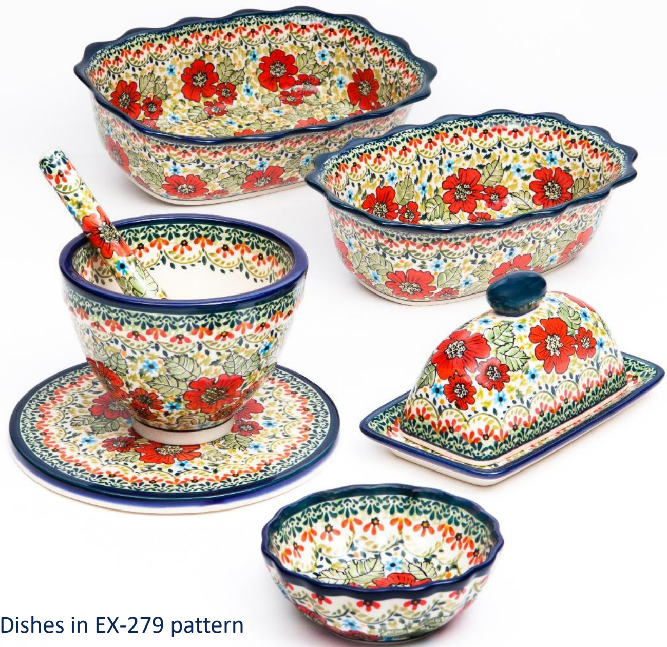
Dishes in EX-279 pattern