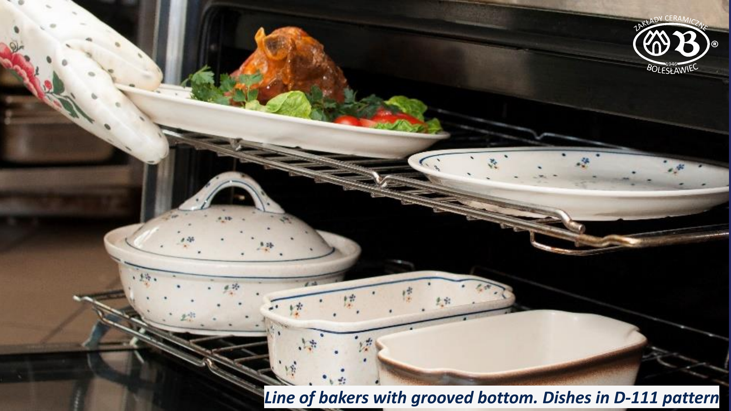
Line of bakers with grooved bottom. Dishes in D-111 pattern