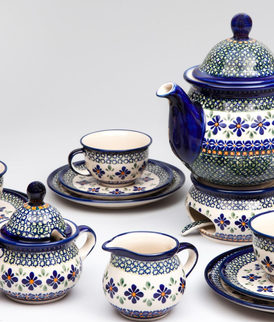
Tea set in DU-60 pattern