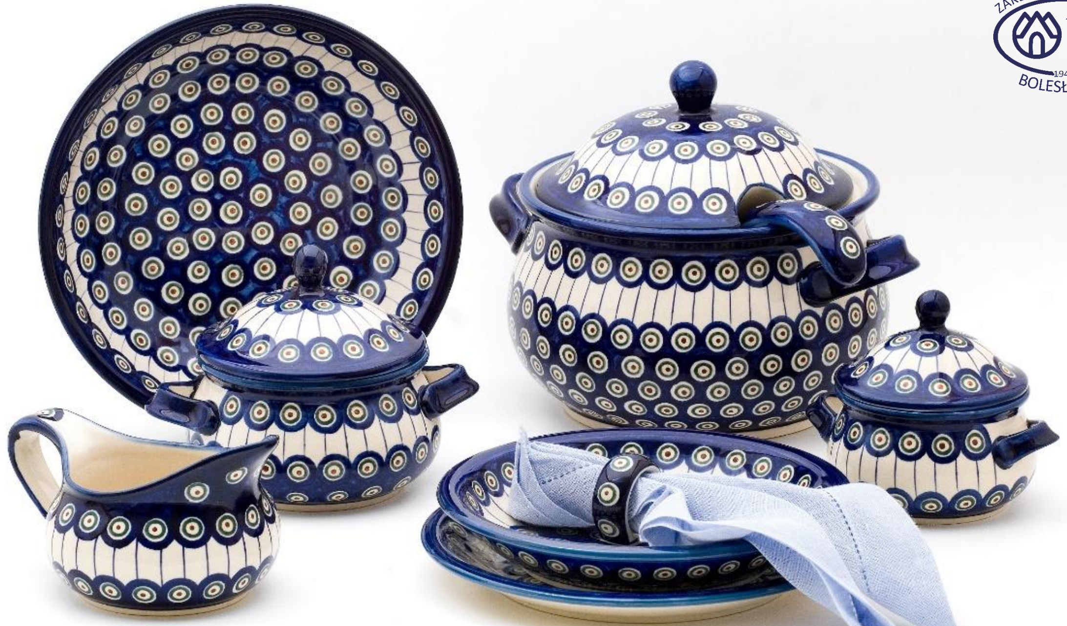
Dinner set ALICJA in D-8 pattern